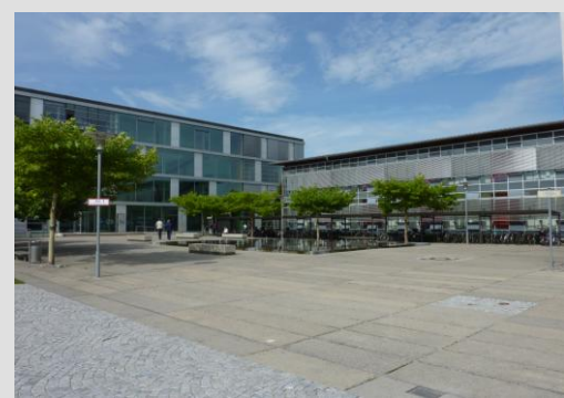
Building IZB West II left entrance, 3 rd floor

phone +49-89-89 96 79-0 fax +49-89-89 96 79-79 http://www.bio-m.org info@bio-m.org